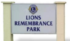
Lions Remembrance Park.