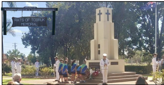
The Rats Of Tobruk Monument Park.