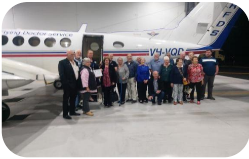
Visiting the Royal Flying Doctor Base - one of the many causes we support.