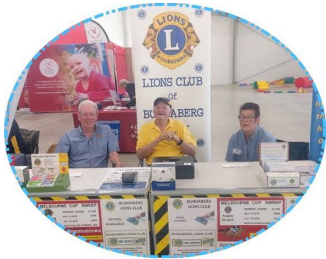
Melbourne Cup Sweep, Christmas cakes, lions Mints, EMIB all at once.