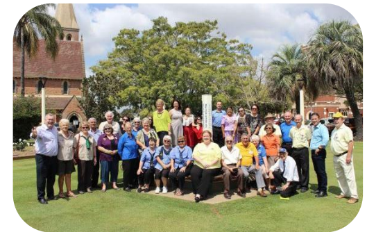
Peace Pole Dedication May peace prevail on Earth