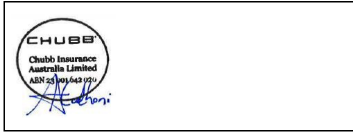
Authorized Signature and Stamp